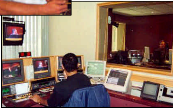
The RSG control room now includes televisions, computers and web access

"I visited stations around the world to see Dalet systems in action. We had to move towards automation and make use of the existing systems. Dalet listened to our needs and together we accomplished, with only 4 extra people, the website, the WAP phone system and the TV side - affordable and not manpower intensive."