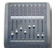
MCS-3000xw (with Wrist Rest and Trim)

MCS-3000xw Physical Specifications ■ 11" x 11.25" x 2.00" (W/Wrist Rest) ■ Weight 9 lbs.