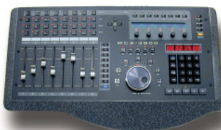
MCS-3800xw (with Stone Wrist Rest and Trim)