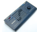
FaderMaster Pro joined with MCS3s

FMPro Physical Specifications ■ 12.25" x 6.75" x 1.5" ■ Weight - 7 lbs.