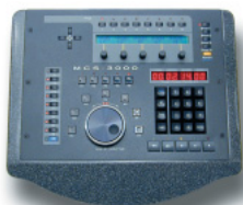
MCS-3000w (with Stone Wrist Rest and Trim)