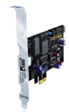
HDSPe PCI Card