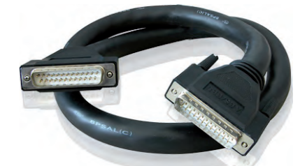
ALVA breakout cable D-sub25 male to D-sub25 male Available with 1m, 3m and 6 m length.