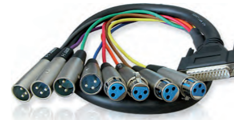
ALVA breakout cable D-sub25 to 4 x XLR-3 female + 4 x XLR-3 male Available with 1m, 3m and 6 m length.

The HDSPe AES in- and outputs can be easily equipped with standard XLR-breakout cables via standard 25-pin D-sub AES/EBU connectors in TASCAM pinout format. TASCAM to Yamaha pinout cables and format converters are also available. Your Premium Line dealer offer various cables - 192 kHz ready - in different lengths (ALVA cableware).